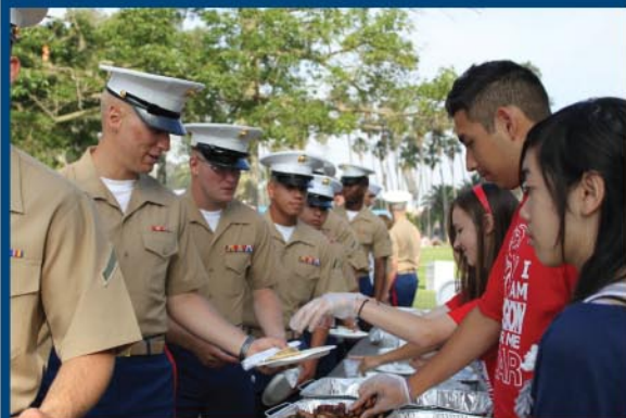
Key Clubbers feed Service Men at the breakfast, left